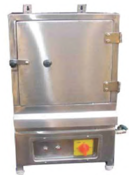
Idli Steamer (Gas / Electric) Cap. : 36 to 250 Itli