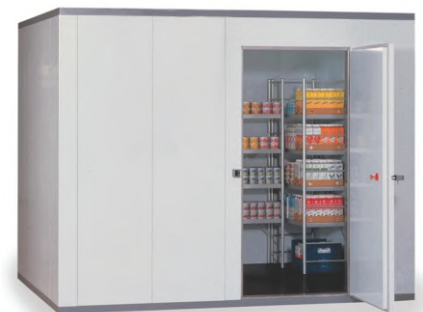
Walk in Chiller / Walk in Freezer Size : Customized