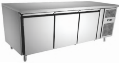
3 Door Under Counter Refrigerator / Freezer Size : Customized