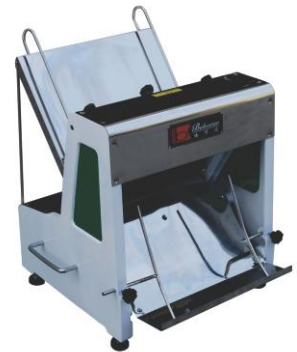
Bread Slicer (Electric) Table / Floor Model

CHANMAG / BERJAYA based on professional know - how with R & D manufacturer technique and satisfactory service attitude, to offer excellent bakery equipment, to contribute the bakery customers. Innovate to develop new product, enhance production technique improve product quality for providing more satisfactory product customers. Keep sincere & honest; identify right & wrong, harmonious to concern each other, to unit together, to develop benefit for share with customers' subcontractor, colleague, stockholder and publics in the country.