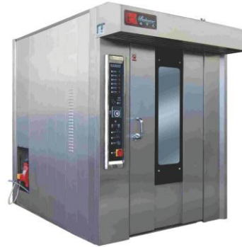
Rotary Oven (Gas / Electric)