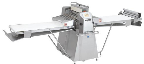
Dough Sheeter (Electric) Table / Floor Model