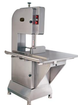
Bone Swa (Electric) Blade : 16/20 mm