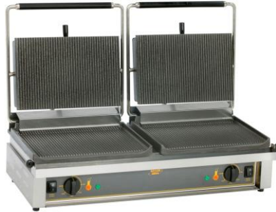
Sandwich Griller (Electric) Single / Double (STD/Jambo)