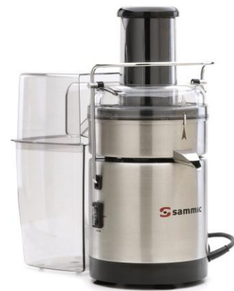
Licuadora Multi Juicer