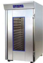
Proofing Chamber (Electric) Customized