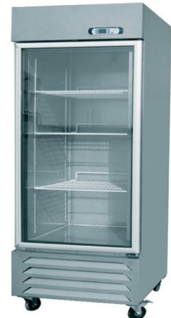
Visi Cooler Capacity : 300 to 500 ltr. (Branded)