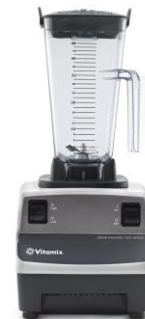
2 Speed Blender