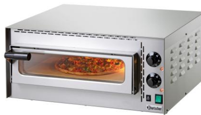
Pizza Oven Electric / Gas (Customised/Imported)