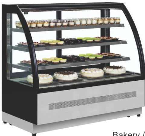
Bakery / Sweet Display Counter Size : Customized