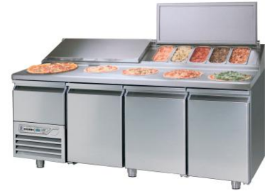
Under Counter (Pizza Makeline) Refrigerator / Freezer Size : Customized