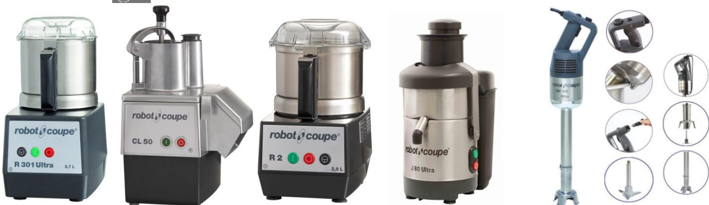
robot coupe ® R 301 Ultra 3,7 L