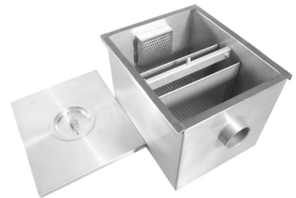
Greash Trap Customized