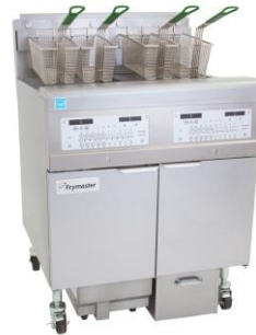
Deep Fat Fryer