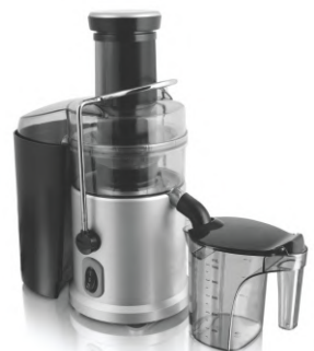
Juicer Mixer Standard/Imported