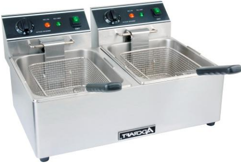
Deep Fat Fryer (Table Top) Single / Double Cap. 4 to 18 ltr.