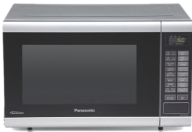
Microwave Oven Branded Cap. 15 to 30 ltr.