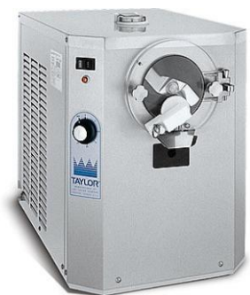
Model : 104