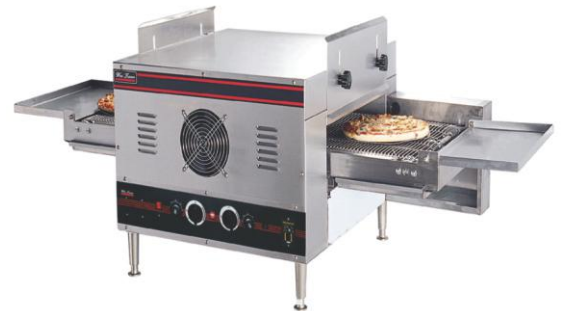
Conveyor Pizza Oven Electric / Gas Imported