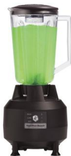
2 Speed Blender