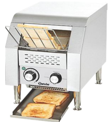
Conveyor Toaster (Electrical) (150 / 300 Slice)