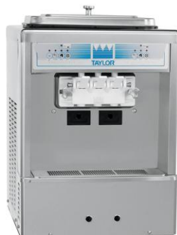
Model : 161